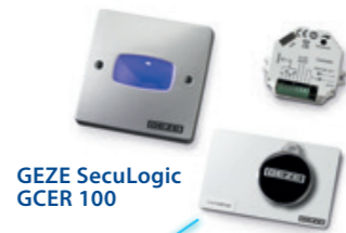
GEZE SecuLogic GCER 100